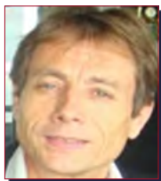
ALAIN CHAPEL Institute of Radiological Protection and Nuclear Safety, France